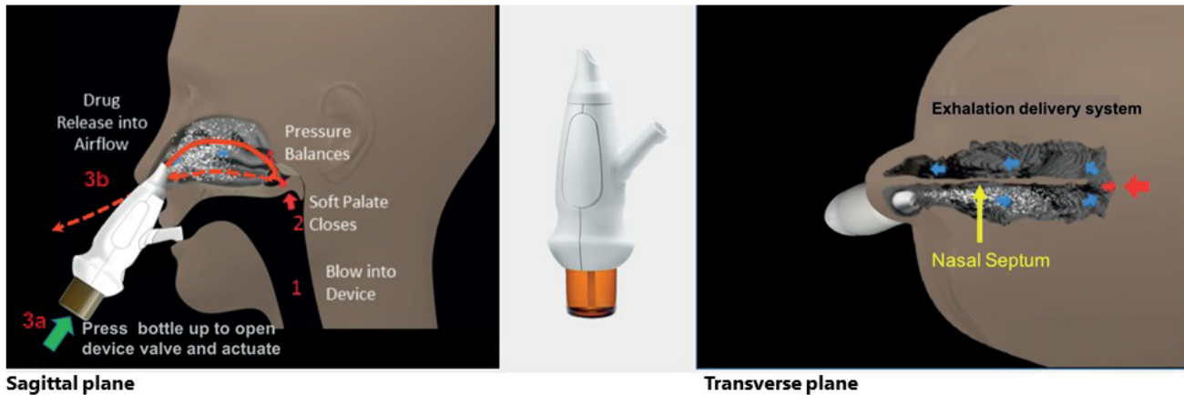
Figure 1. Exhalation Delivery System (EDS) mechanism of action. The EDS has a flexible mouthpiece and a sealing nosepiece. The nosepiece is uniquely shaped to seal at the nostril in order to transfer pressure from the oral cavity, avoid obstruction by compression of soft tissue, and stent/expand the upper part of the nasal valve. Exhalation through the EDS: 1) creates an airtight seal of the soft palate, isolating the nose from the mouth and lungs, 2) transfers proportional pressure into the nose, and 3) helps "float" medication around obstructions to deposit in high/deep sites throughout the nasal labyrinth, such as the OMC. "Positive-pressure" delivery expands passages narrowed by inflammation (versus negative pressure delivery, "sniffing"). The transferred pressure is proportional to varying exhalation force, counterbalancing pressure across the soft palate. This assures a patent communication behind the nasal septum, allowing air to escape through the opposite nostril. Use is simple and quick. A patient inserts the nosepiece into one nostril and starts blowing through the mouthpiece. This elevates and seals the soft palate, as with inflating a balloon, separating the oral and nasal cavities. The patient completes use by pressing the bottle to actuate. This causes a coordination-reducing valve to release the exhaled breath concurrently with aerosol spray in a "burst" of naturally humidified air that escapes through the contralateral nostril after depositing the drug particles (59) .

1 had to be congestion or rhinorrhea, lasting \geq 3 months, and receive a diagnosis from a specialist after endoscopic examination. Defining symptoms included nasal congestion/obstruction, rhinorrhea, facial pain/pressure, and reduction/loss of smell. Participants with comorbid asthma or COPD had to be stable at entry (no exacerbations within 3 months of screening). Inhaled pulmonary corticosteroid use was limited to stable doses \leq 1000 \mu\text{g}/\text{day} of beclomethasone (or equivalent) for at least 3 months prior to screening. Treatment with any other intranasal corticosteroid or an orally inhaled corticosteroid was not permitted, except for the above-mentioned drugs and doses for asthma and COPD.