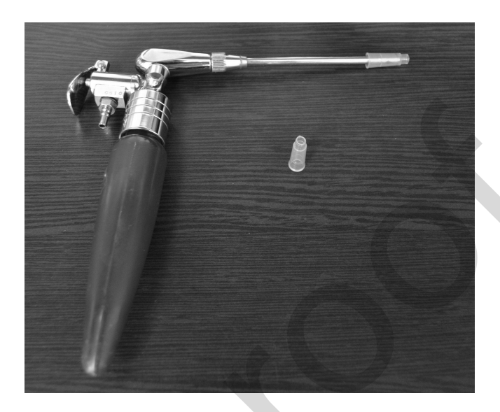
Figure 1. The Venturi atomizer and the specially made nozzle tip cap. The specially designed cap to be attached to the nozzle of the Venturi atomizer was made by removing the anterior half of a pipette tip.

Fifteen healthy subjects were enrolled in the study, and each nostril was regarded as a separate sample. A total of 30 samples were tested and collected. Before the test began, the Venturi atomizer (Nagashima Medical Instruments, Tokyo, Japan) was sterilized by immersion in 70% alcohol for 10 minutes before each use. The reservoir was filled with sterile saline. The sterile nozzle caps were attached before each spray and then collected immediately after each spray. The caps along with the collected aerosol particles were placed in a test tube for further bacterial culture. The first spray was aimed at the lumen of a sterile 5 ml syringe, and the results of the cap cultures were regarded as negative controls. Following the first spray, a new sterile nozzle cap was used, and the following 3 sprays were aimed at one side of the nasal cavity of an enrolled test subject. After the spray, the cap along with the collected aerosols were immediately placed into the culture medium and sent for culture.