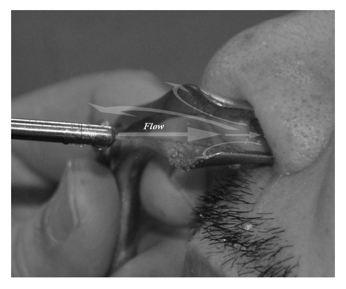
Figure 2. Venturi atomizer nasal applications. During the spray process, remarkable aerosols were noted traveling backwards through the reversed jet flow and attaching to the nozzle tip.