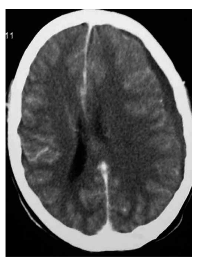
Figure 3. Subdural empyema on the left fronto-parietal convexity. The subdural collection repulses midline structures.