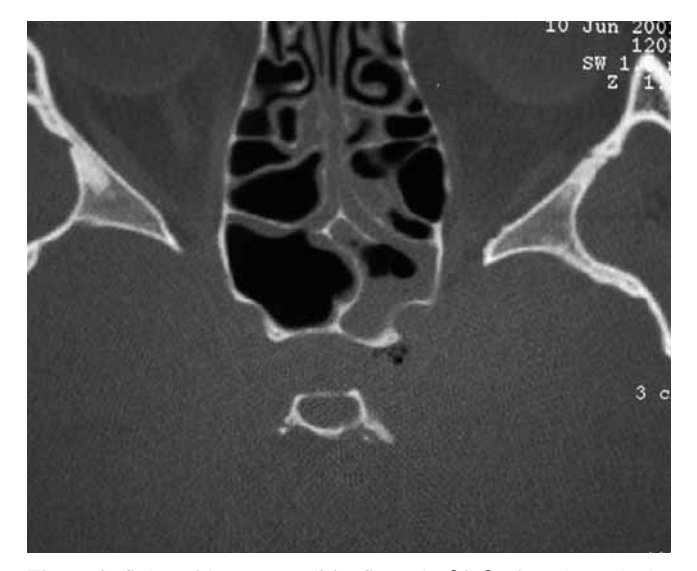
Figure 2. Sphenoid osteomyelitis. Spread of infection through the bone is attested by the presence of gas bullae in the left cavernous sinus.