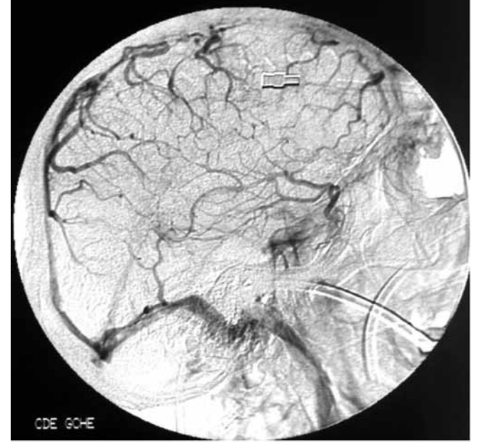
Figure 6. Sagittal superior sinus thrombosis. On this lateral brain venogram, contrast enhancement is interrupted in the superior sagittal sinus.