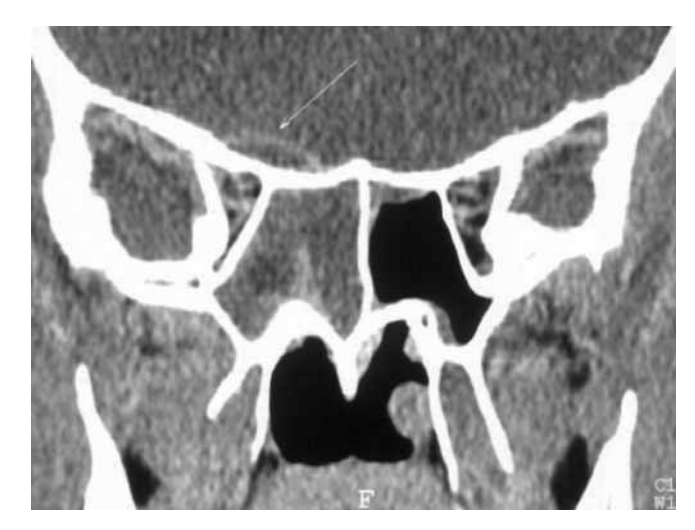
Figure 4. Extradural empyema of the planum sphenoidale.