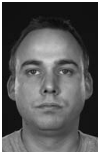
Figure 5. Post-operative photograph of patient who underwent combined Batten and Spreader graft insertion 1 year previously.

As INVI is a dynamic condition and can only be demonstrated by direct visualization of nasal valve area whilst the patient is breathing the diagnosis can be missed. We feel that airflow improvement using the Cottle's manoeuvre and modified