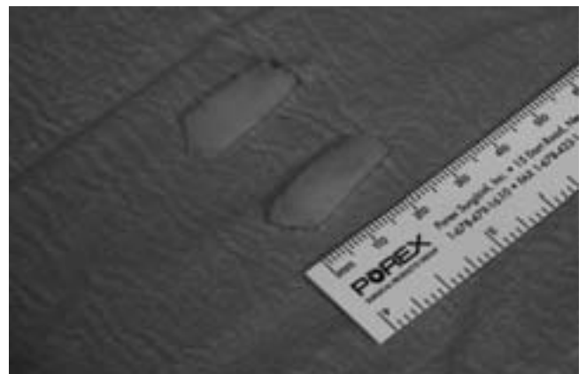
Figure 3. Harvested batten grafts from septal cartilage prior to insertion.