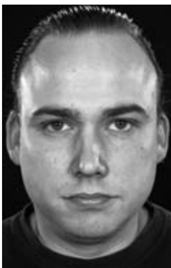
Figure 4. Pre-operative photographs of patient who underwent combined Batten and Spreader graft insertion.

Post-operative complications included 1 graft reabsorption and 1 graft migration, which both required a revision procedure. Both improved with subsequent surgery.