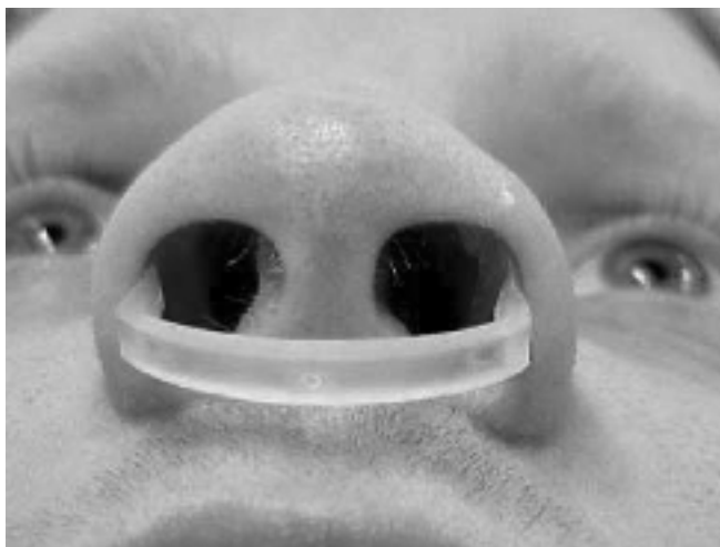
Figure 2. The plastic dilator Nozovent® in position. The dilator tends to straighten up and simultaneously moves the lateral walls of the vestibule laterally, dilating the valve area.

the nasal strip has been used (Scharf et al., 1994 and 1996a; Ulfberg and Fenton, 1997; Todorova et al., 1998; Gosepath et al., 1999; Pevernagie et al., 2000). In newborns, the nasal strip has reduced the frequency of obstructive respiratory events (Scharf et al., 1996b). It has also been useful in managing pregnancy- or rhinitis-related nocturnal nasal congestion (Turnbull et al., 1996; Pevernagie et al., 2000).