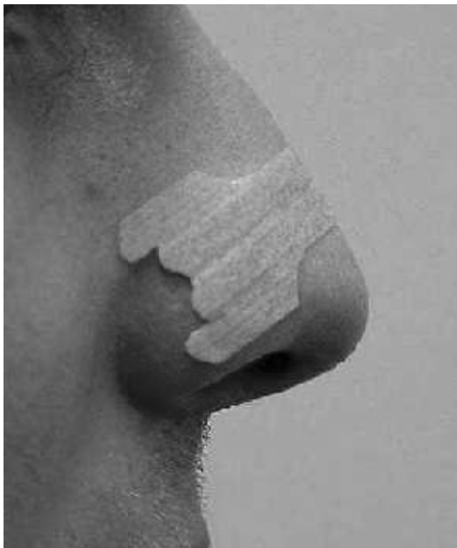
Figure 1. The Breathe Right® nasal strip is placed on the front part of the nose. It pulls the lateral walls of the vestibule laterally and dilates the valve area.