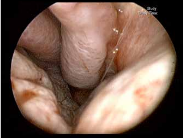
Figure 3. The sinusoscopic finding of a left-sided nasal cavity after submucosal implantation of Medpor® at the nasal floor.