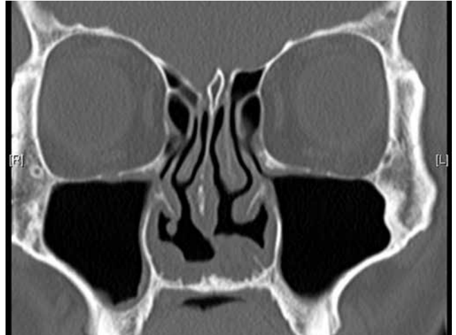
Figure 4. The sinus CT after submucosal implantation of Medpor® showed more appropriate volume of nasal cavity.

Ultra Thin Sheet which is made in sizes of 38 x 50 x 0.85 mm and cut it in to pieces in the size of 8 x 25 mm to 8 x 40 mm according to the length of the patient's nasal floor and the site of implantation. Multiple pieces of Medpor® Ultra Thin Sheet were used to form the ideal contour of submucosal implantation. During follow-up, we also performed sinuscopy on all patients to examine the nasal mucosa and nasal cavity.