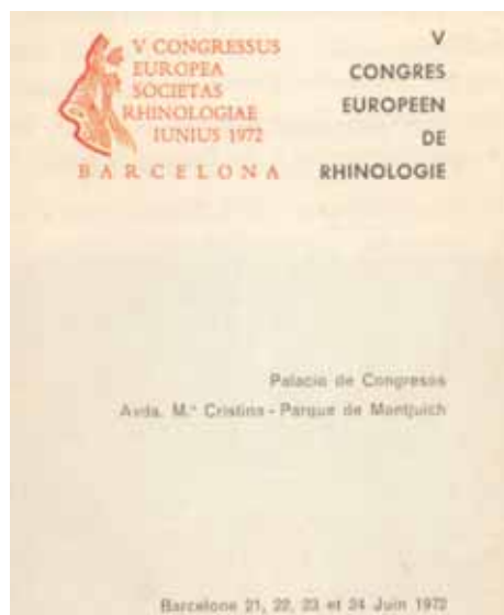
Figure 1. ERS congress in 1972.