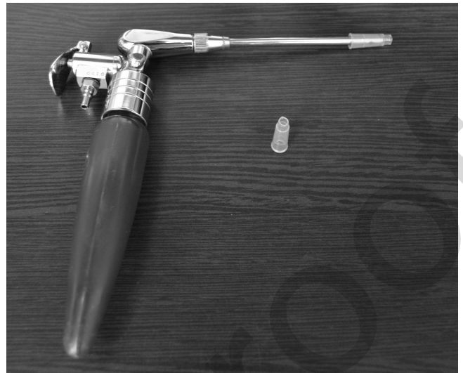
Figure 1. The Venturi atomizer and the specially made nozzle tip cap. The specially designed cap to be attached to the nozzle of the Venturi atomizer was made by removing the anterior half of a pipette tip.

Fifteen healthy subjects were enrolled in the study, and each nostril was regarded as a separate sample. A total of 30 samples were tested and collected. Before the test began, the Venturi atomizer (Nagashima Medical Instruments, Tokyo, Japan) was sterilized by immersion in 70% alcohol for 10 minutes before each use. The reservoir was filled with sterile saline. The sterile nozzle caps were attached before each spray and then collected immediately after each spray. The caps along with the collected aerosol particles were placed in a test tube for further bacterial culture. The first spray was aimed at the lumen of a sterile 5 ml syringe, and the results of the cap cultures were regarded as negative controls. Following the first spray, a new sterile nozzle cap was used, and the following 3 sprays were aimed at one side of the nasal cavity of an enrolled test subject. After the spray, the cap along with the collected aerosols were immediately placed into the culture medium and sent for culture.