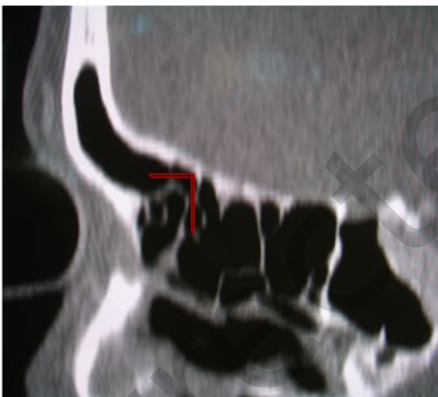
Figure 2. a) Sagittal CT-scan of a frontal recess and frontal sinus where transition-angle is 90° (as indicated with red lines), Balloon insertion failed due to problems getting the guide wire around the curve when inserting the appropriate guide catheter in the middle meatus (symbolic image).

Success and failure rates for “Balloon-Only” and “Hybrid” procedures. Failure rate is further subdivided into insertion, dilation and “not tried” failure.