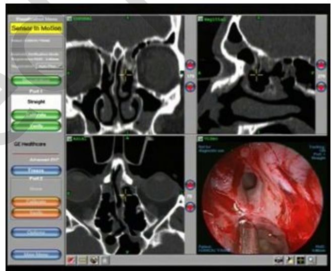
Figure 2. b) Computer assisted navigational image (InstaTrak® 3500 Plus by GE Healthcare, Vienna, Austria) of an intraoperative situation where insertion of the guide wire into frontal sinus failed due to a naso-frontal angle of 90°, though the case was considered ideal for BSP preoperatively.

explained below, in accordance with the study protocol approved by the Medical University Ethics Committee.