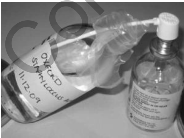
Figure 3. Image of nozzle into staph solution set up.