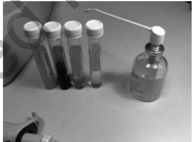
Figure 2. Image of the dyes close up.