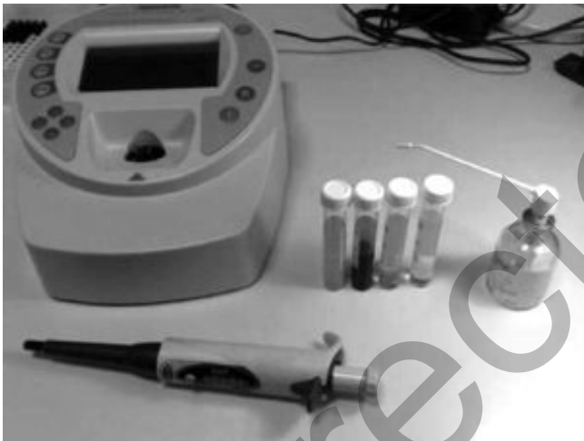
Figure 1. Image of the spectrophotometer together with Xylocaine spray and dyes.