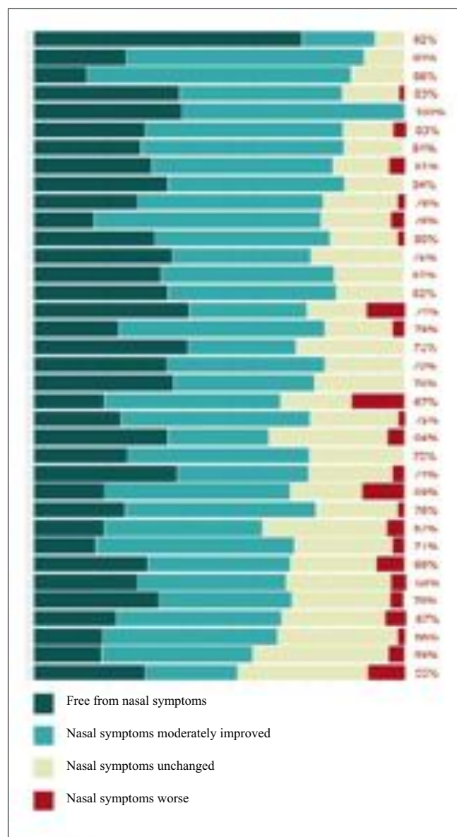
Figure 1. Results of septal surgery in Sweden in 2007 and 2008 as judged by the patients six months after surgery. The results of different departments are listed. The percentages (%) represent the total number of patients who were completely or moderately improved.

method can miss an abnormality; for example, a posterior deviation is often missed with AR if there is a more prominent anterior deviation. This is also why two complementary tests are recommended (16,39,40) . RM appears to be preferable for selecting suitable candidates for septal surgery if only one test is used. In this era of objective measures, when evidence based medicine is the norm, the comment “in my hands” is not appropriate.